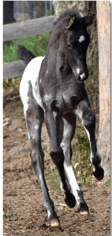
SOLO - Ironhorse Black Pearl x Yallawa Boys Night Out